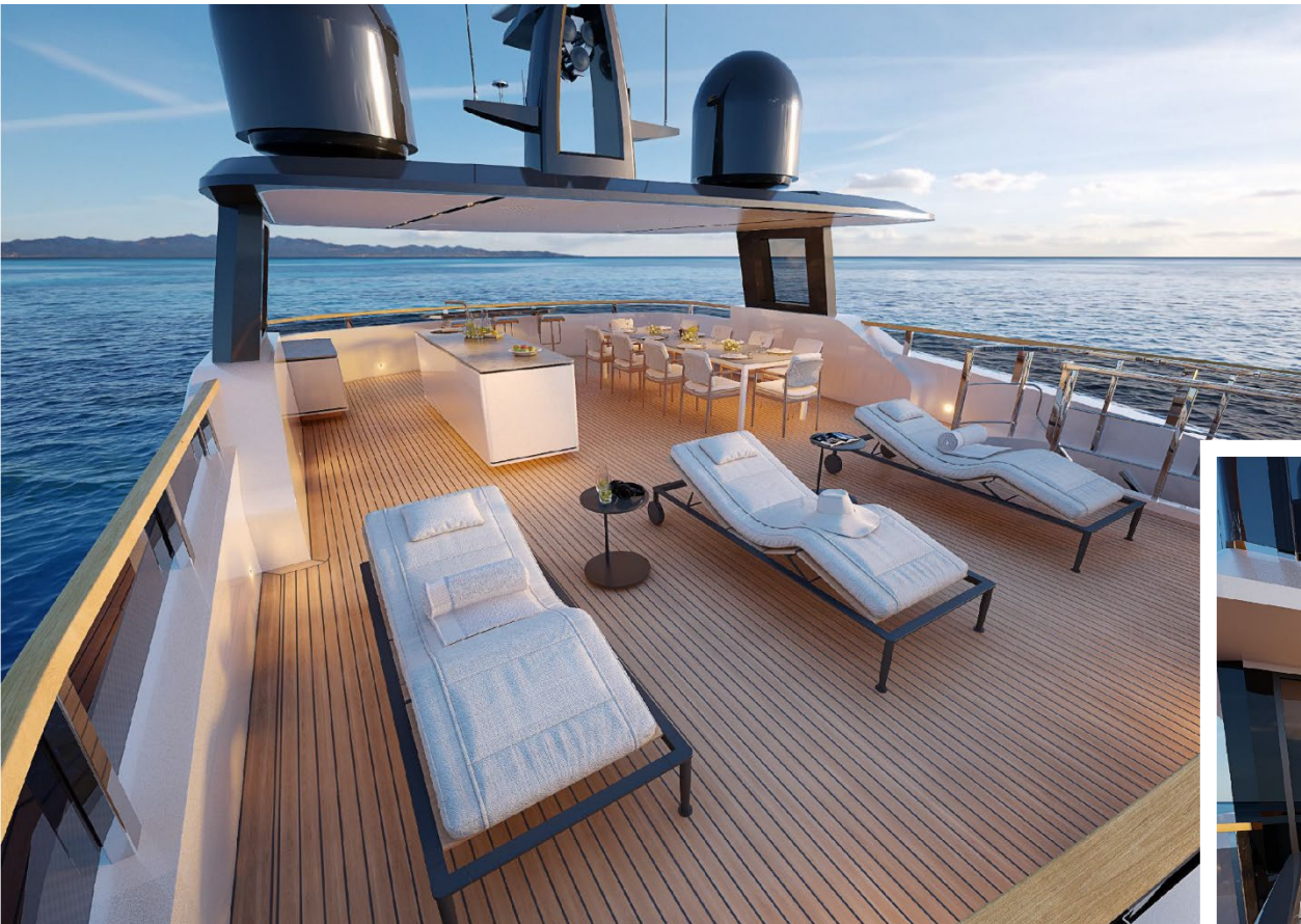
SKYLOUNGE AFT DECK