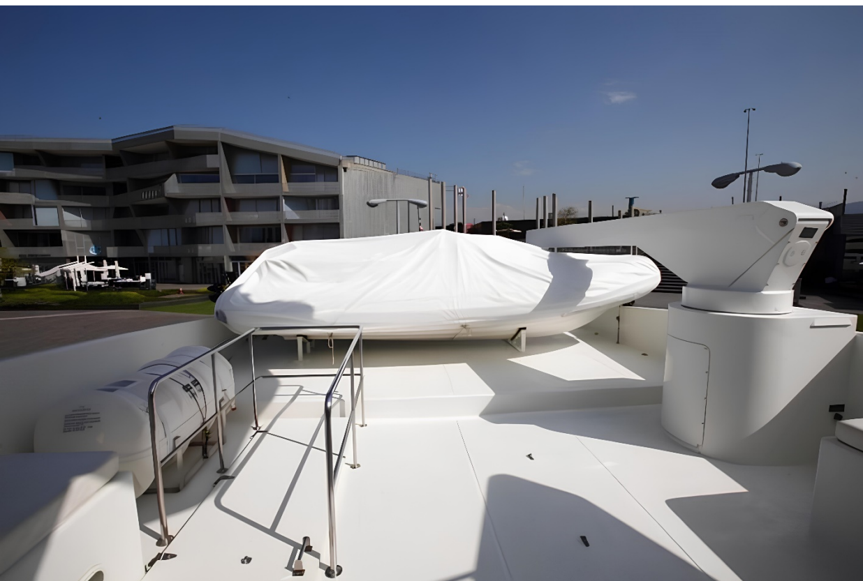
AFT SKYLounge DECK