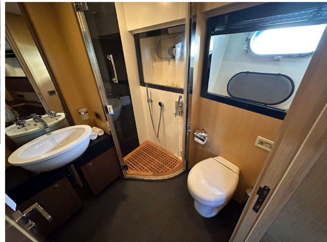
MASTER CABIN & HEAD