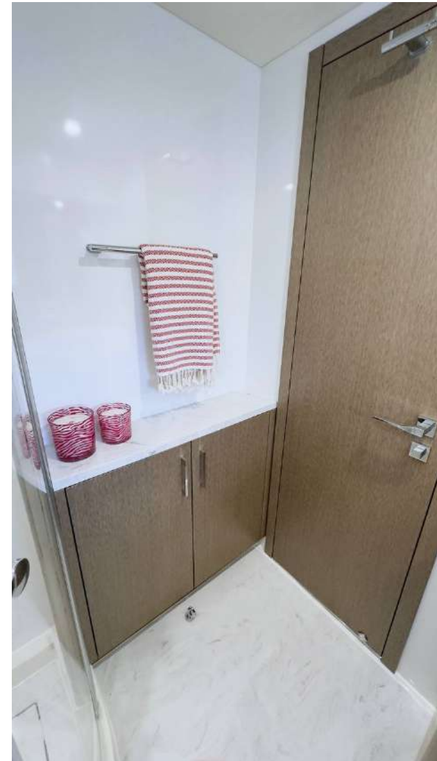
VIP BOW SUITE